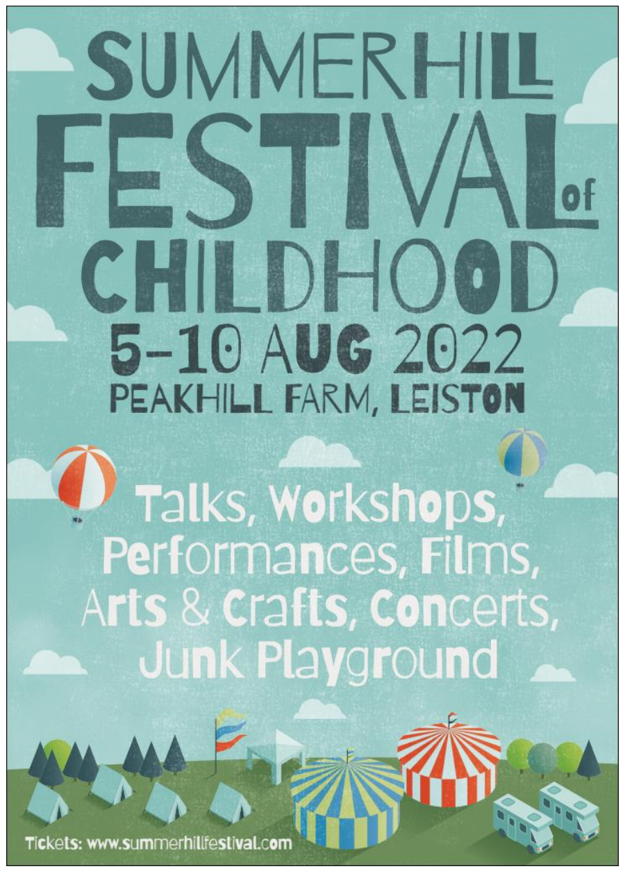
Google Map link showing you to the entrance of the festival: <a href="https://goo.gl/maps/Ha9bTZgEarogrXVMA">https://goo.gl/maps/Ha9bTZgEarogrXVMA</a>